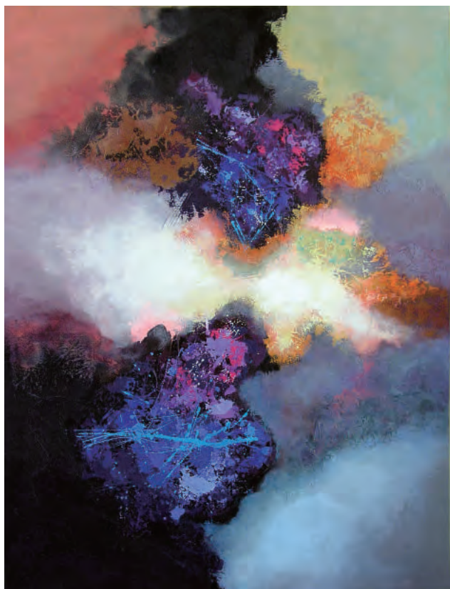
Tanzanite 坦桑石 2016 Mixed Media on Canvas 複合媒材 104 x 80 cm

Earth gives birth to the gemstones in extreme conditions. Extreme pressure and temperature, over extreme period of time create cores of concentrated energy. These are purified by fire, hardened by pressure and once light is added to the equation, they come alive. The "Gemstones" collection of paintings captures the way I imagine this creation to come about. In the paint application techniques, I aimed to emulate the effortless way nature created them: with bold strokes, creating harmony of light and colour, within the chaos of formlessness.