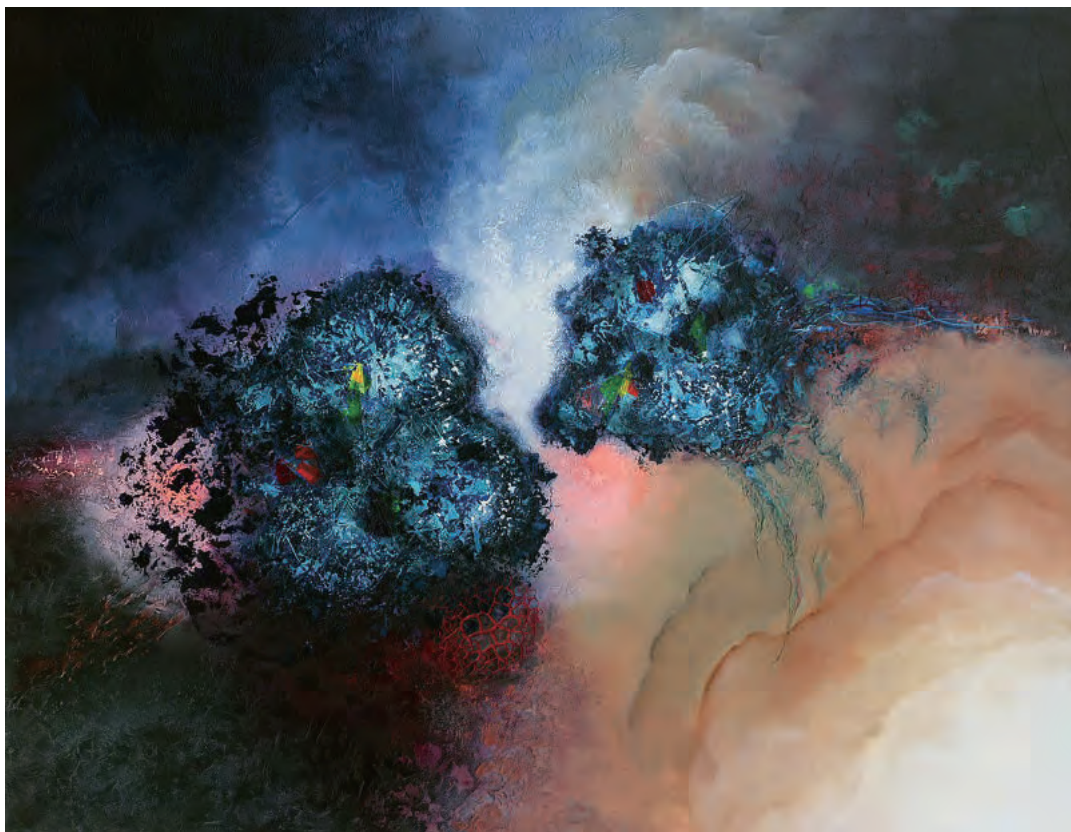
Blue Zircon 藍鋯石 2016 Mixed Media on Canvas 複合媒材 104 x 135 cm