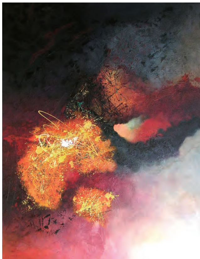
Yellow Diamond 黃鑽石 2016 Mixed Media on Canvas 複合媒材 135 x 104 cm