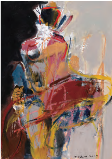
女人花系列 Series of "Women & Flower"

He is appointed as a professor in Nan Kai University as well as chief director of their Art Centre. In 1990, he has held the first solo exhibition in National Museum of Taiwan in Taichung while he was only 24 years old. He was awarded the second prize in the 14th National Fine Arts Exhibition in 1995. And, in 1997, he had been chosen for excellence in the 10th Nan-Ying Art Exhibition. Since then, he never stop hold solo or group exhibitions in Taiwan. His works are in the collections of National Taiwan Museum of Art, Taichung; Yu Hsiu Museum, Nantou and among other private collections.