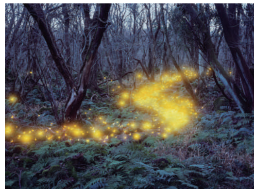
Nabi 07 蝴蝶 2015 2015 C-Type Print 攝影輸出 120 x 160 cm