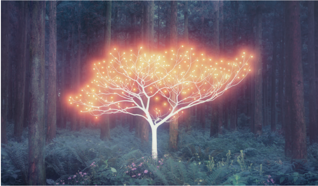
Tree of Life in Island 5-3-1 島上的生命之樹 5-3-1 2013 C-Type Print 攝影輸出 76 x 130 cm