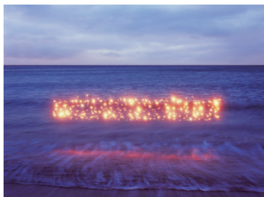
Nabi 05 蝴蝶 05 2015 C-Type Print 攝影輸出 90 x 120 cm